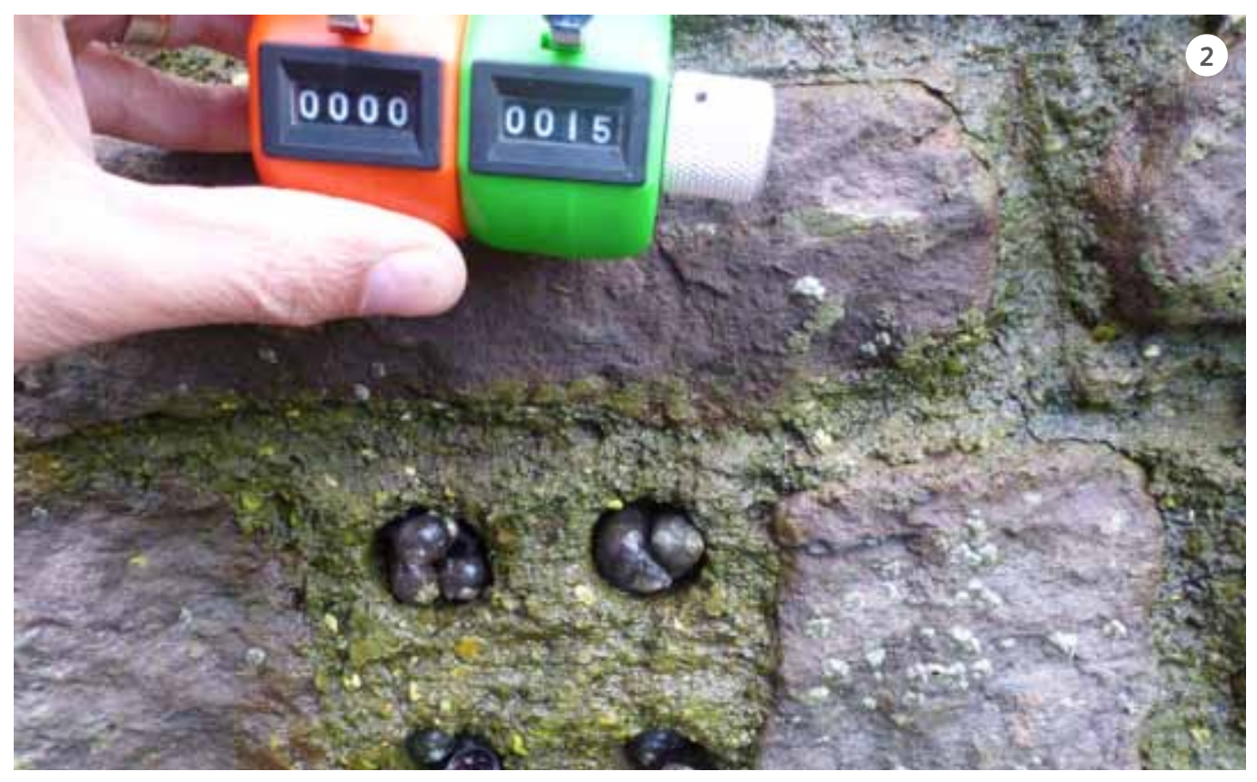
(2) Niche habitat colonisation after 18 months

(1) Construction of two walls of the Shaldon and Ringmore tidal defence scheme, into which ecological enhancements were incorporated. May 2010