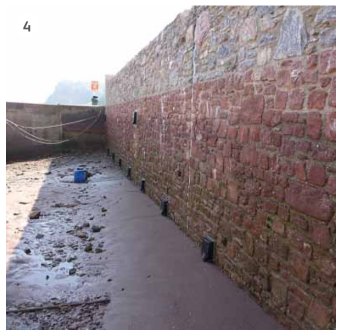
(4) New flood wall with ecological enhancements. Note low visual intrusion