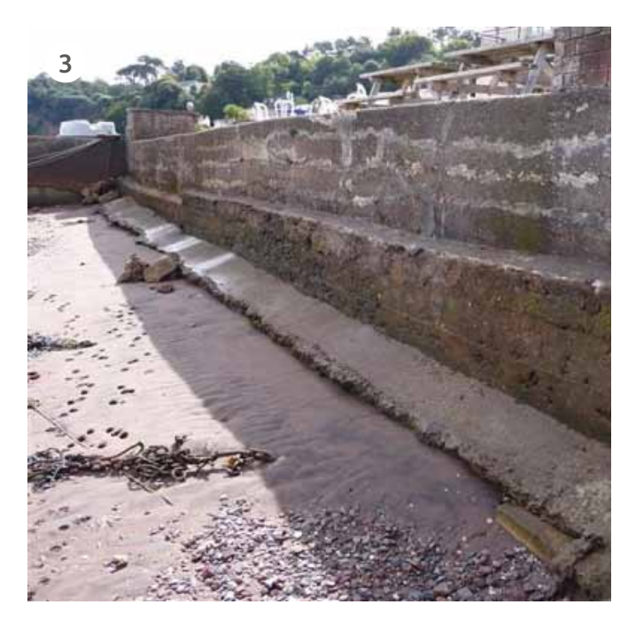
(3) Old flood wall with low numbers of species and individuals

As several of the existing concrete walls were beyond repair, new walls were required in places. These were built from local stone with mortar pointing (Figures 3 and 4). This necessitated a modest 'advancement' of the line of protection (approximately 1 m). The new walls encroached onto the mixed sand and gravel foreshore, which was not designated for its ecology and was of modest ecological value due to degradation caused by compaction by human activity (e.g. walking and boating) on the foreshore. For these reasons, it was decided that restoration of the foreshore would yield limited ecological gains. However, the scheme required planning approval and the Environmental Impact Assessment required some form of ecological compensation to offset impacts.